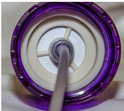
Fig 1 – Image of filter within the cap

We are contacting you urgently to replace any of the unfiltered water bottle caps that you may have with the filtered range. This will be done free of charge. If you are in any doubt, just look at the inside of the water bottle top to see if a filter is present. The below image shows what the filtered cap should look like.