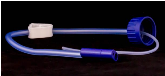
Endo Flow for use with Baxters